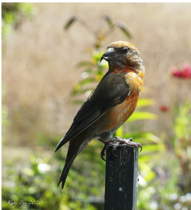
Crossbill - a beak made for seeds

CNPS Seed Collection Ethics and Best Practices: https://www.cnps.org/wp-content/uploads/2021/03/PS-20_Professional_Collecting_Ethics_and_Best_Practices.pdf